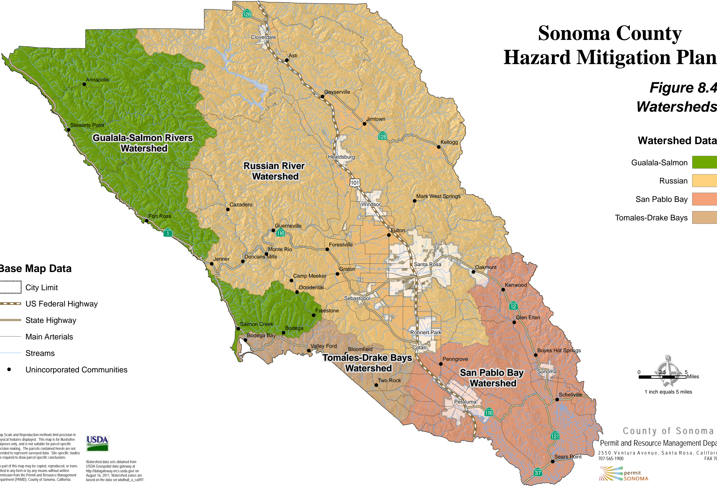
Figure 8.4 Watersheds