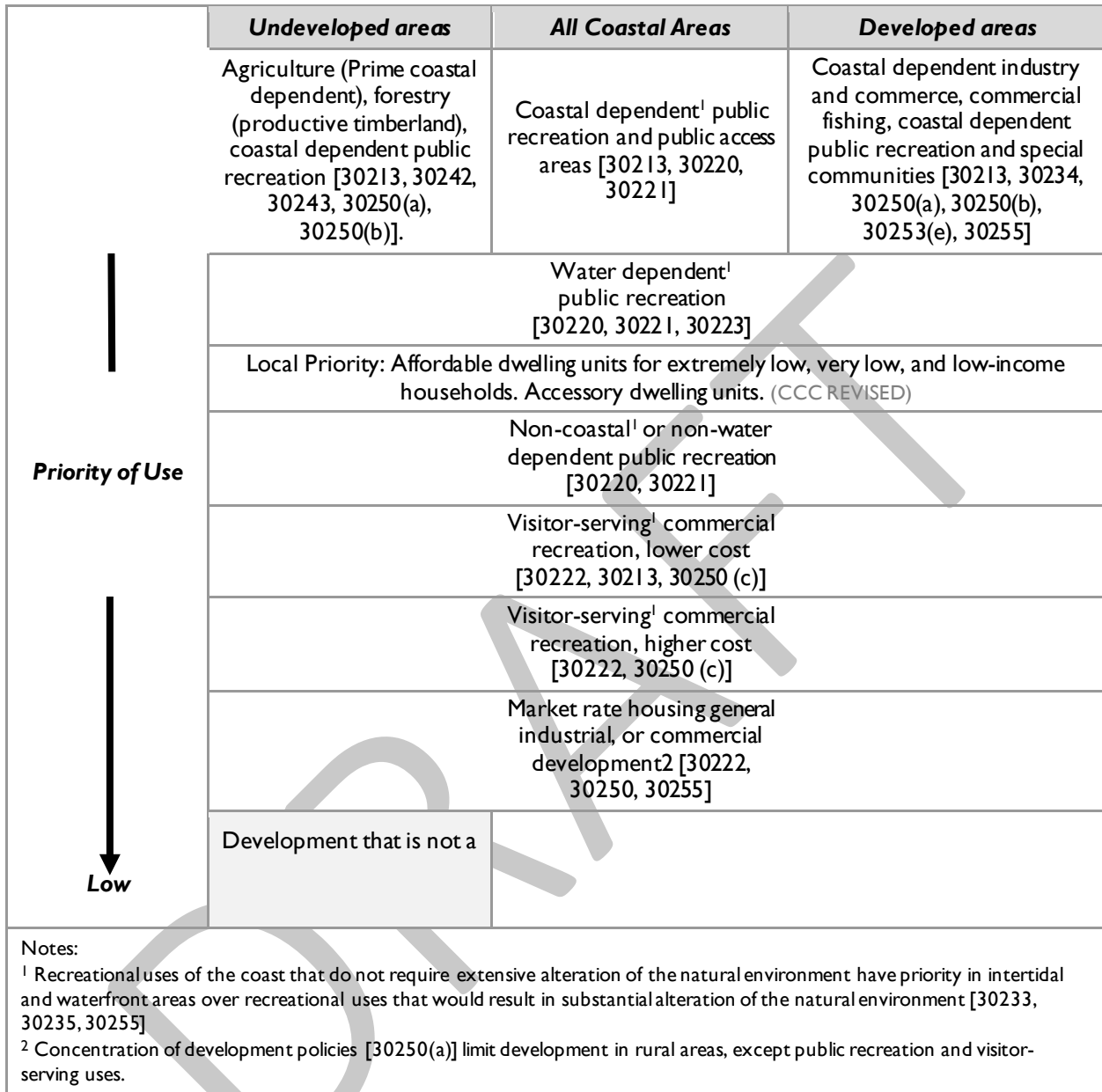
Table C-LU-1: Priority of Coastal Land Uses