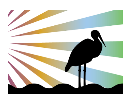
Local Coastal Program Permit Sonoma

2550 Ventura Avenue Santa Rosa, CA 95403