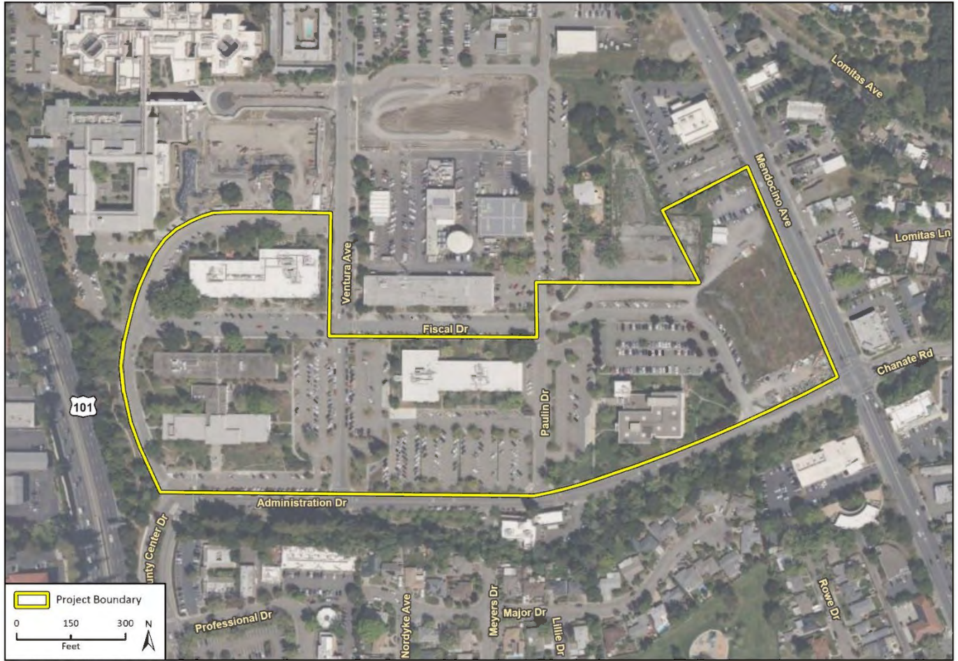
Figure 2: Project Site Location