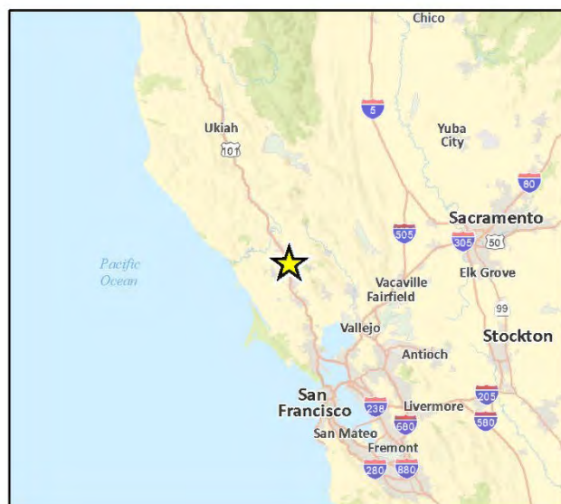
Figure 1: Regional Location