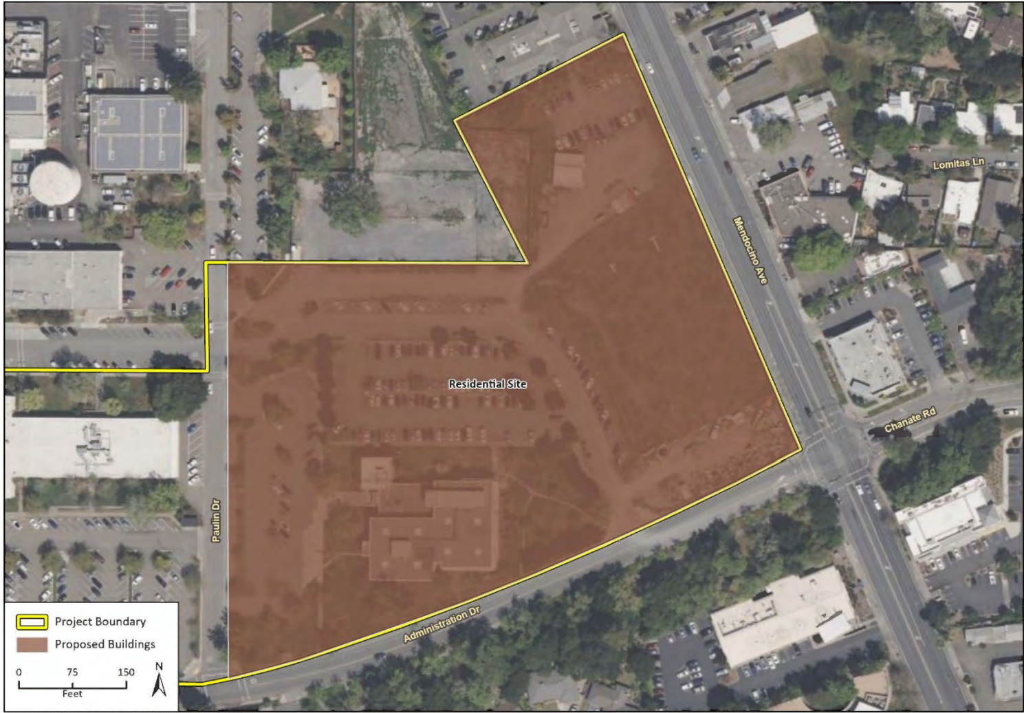
Figure 4: Proposed Residential Site