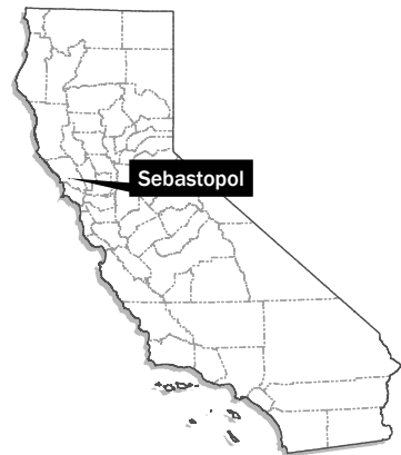
Fire Hazard Severity Zones (FHSZ) in Local Responsibility Area (LRA), as Identified by the State Fire Marshal