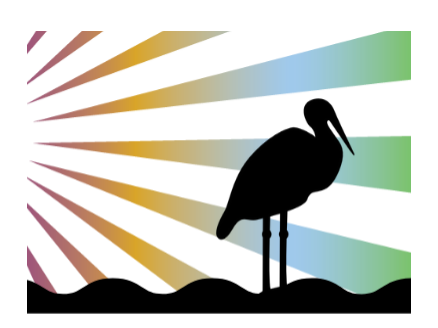
Local Coastal Program Permit Sonoma

2550 Ventura Avenue Santa Rosa, CA 95403