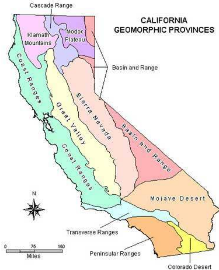
Figure 1. California Geomorphic Provinces

Alternatively, the Permittee may use a geomorphically based hydromodification standard or set of standards and analysis procedures designed to ensure that Regulated Projects do not cause a decrease in lateral (bank) and vertical (channel bed) stability in receiving stream channels. The alternative hydromodification standard or set of standards and analysis procedures must be reviewed and approved by the Regional Board Executive Officer.